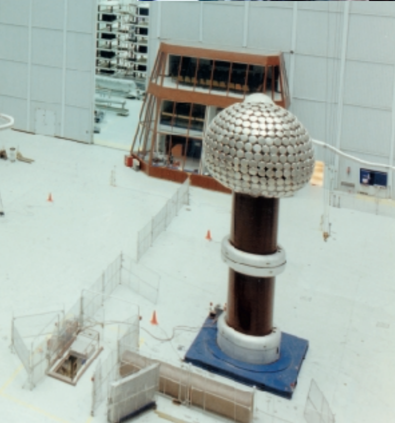
High-voltage laboratory main test hall