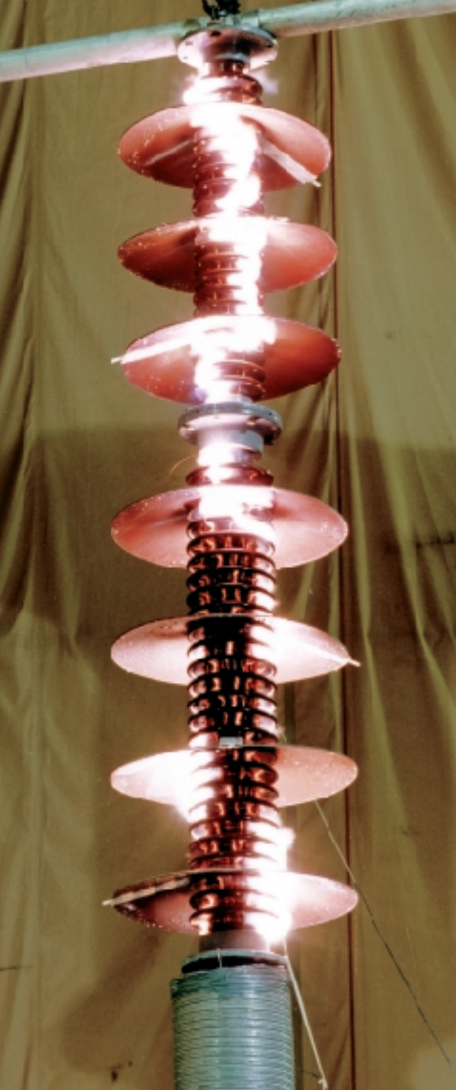
Tests performed on an insulating structure equipped with auxiliary sheds made of rubber