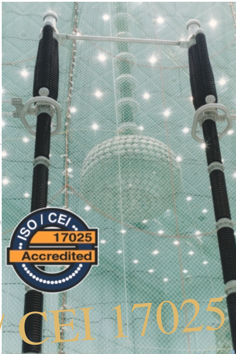
765-kV compressed-gas circuit breaker

A major component of Hydro-Québec's research facilities, the high-voltage laboratory ranks as one of North America's leading research and testing centres for high-voltage lines and equipment.