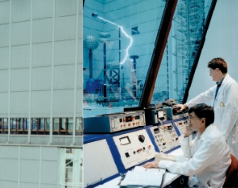
Main hall control room