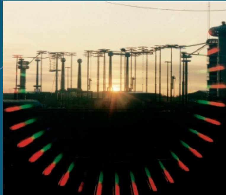
HV underground-cable test area